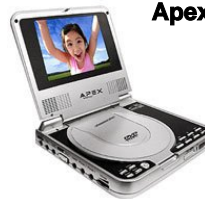
Apex PD-500 Portable DVD Player, used

As a result, EZAuctionAgent consistently earned higher selling prices on the items that included a warranty, compared to similar items without warranties. The included warranty let the buyers worry less about the item condition and focus on bidding for the item they really wanted to win!