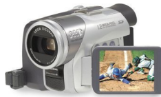
Panasonic PV-GS120 Camcorder, used

EZAuctionagent: $74.06 Without Warranty: $63.85