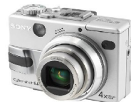
Sony DSC-V1 5 MegaPixel, used

EZAuctionagent: $475.00 Without Warranty: $405.99